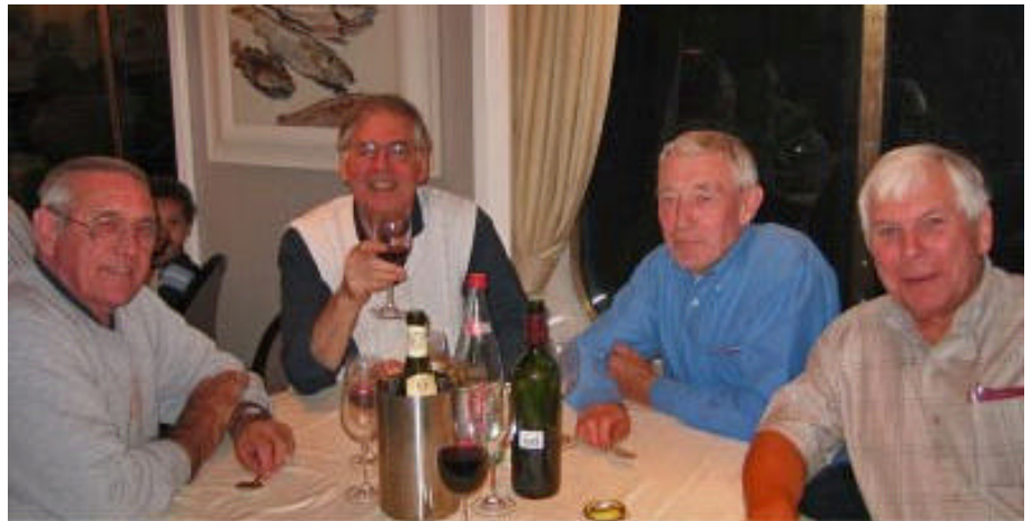
Residents of the 'Bide-A-Wee Home for Superannuated Bikers' await the weekly bingo session. *